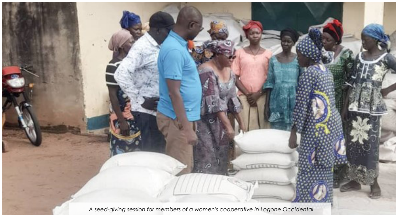
A seed-giving session for members of a women's cooperative in Logone Occidental

In preparation for the 2024 agricultural season, the national coordination of the Food System Resilience Programme in Chad (FSRP-Tchad) launched a vast operation to distribute improved seeds. More than 3,000 tonnes of sesame and maize seeds were distributed to over 5,000 farmers ... Read more