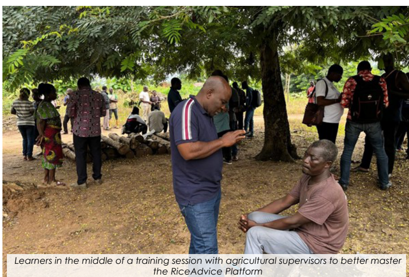
Learners in the middle of a training session with agricultural supervisors to better master the RiceAdvice Platform