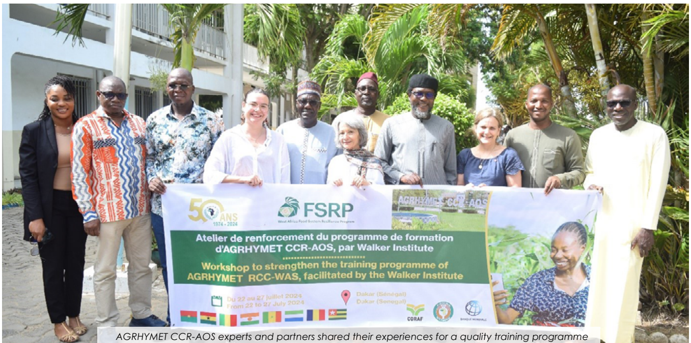
AGRHYMET CCR-AOS experts and partners shared their experiences for a quality training programme

As part of the implementation of Component 1 of the West Africa Food System Resilience Programme (FSRP), AGRHYMET CCR-AOS, in collaboration with Walker Institute, organized a workshop for the co-development of training and validation modules from 21 to 26 July 2024 in Dakar (Senegal)... Read more