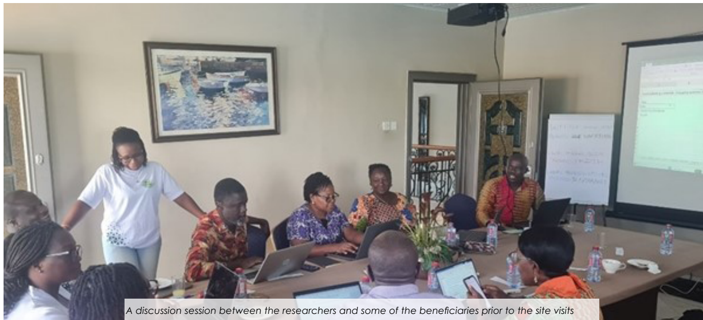
A discussion session between the researchers and some of the beneficiaries prior to the site visits

Ghana: FSRP promotes 15 technological innovations with a view to their adoption by 240,000 beneficiaries