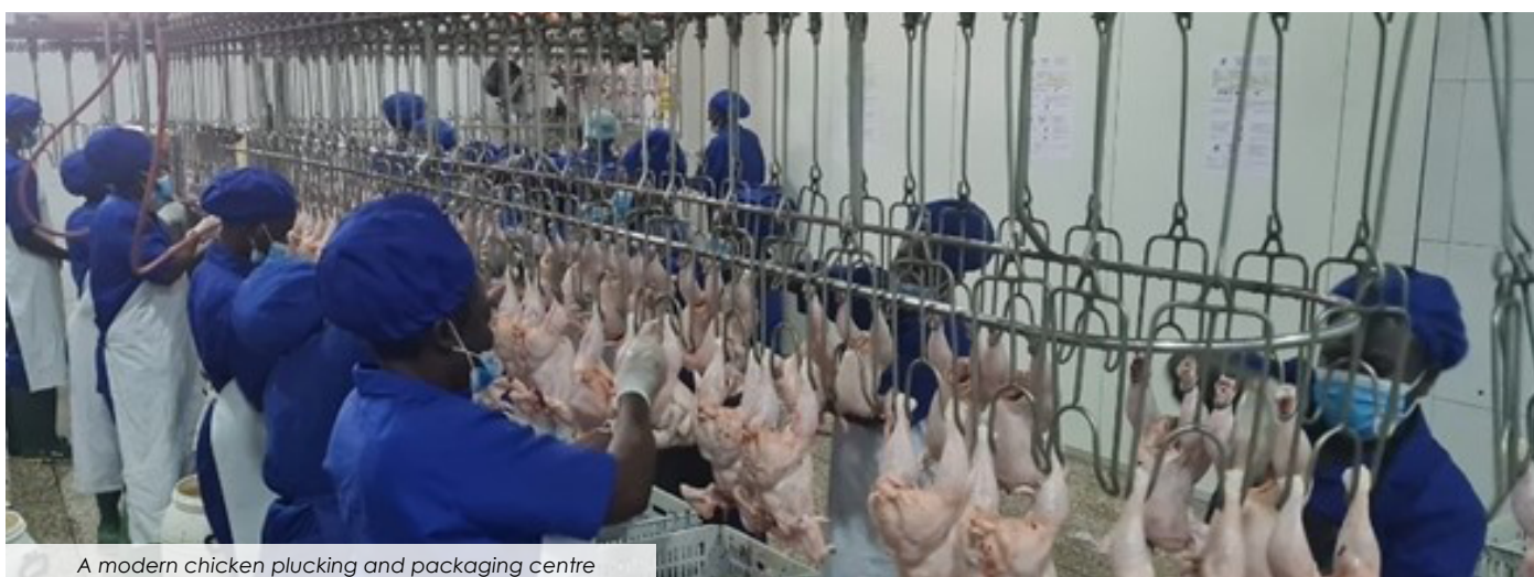
A modern chicken plucking and packaging centre

The first batch of broilers from the Ministry of Food and Agriculture's (MOFA) West Africa Food System Resilience Programme (FSRP) is now ready to be processed into whole chickens and pieces for packaging and marketing, having reached the mature age of 7 weeks, with an average live weight of 2.9 to 3 kilos ... Read more