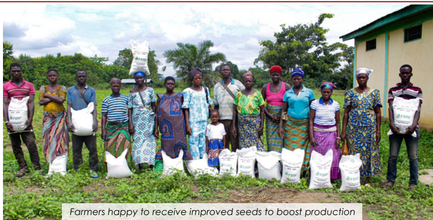
Farmers happy to receive improved seeds to boost production

As part of GAFSP's additional support, the FSRP TOGO has acquired input kits consisting of certified seeds of improved varieties of maize (biofortified maize), cowpea, soya, rice and other inputs (fertilisers, pesticides, etc.) for 28,362 selected agricultural producers... Read more