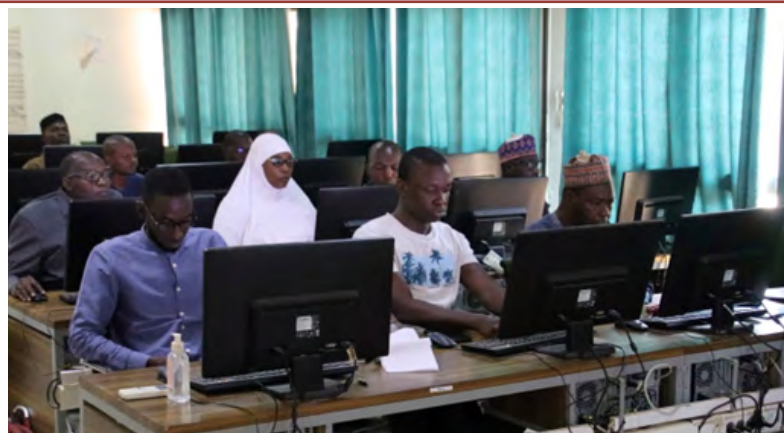
A view of the participants in the training course on satellite data collection and processing