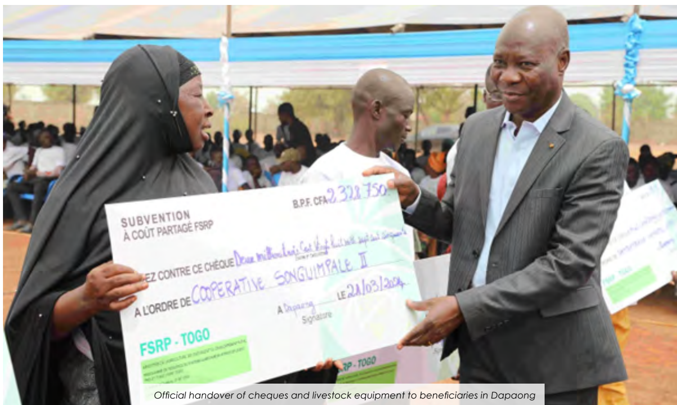
Official handover of cheques and livestock equipment to beneficiaries in Dapaong