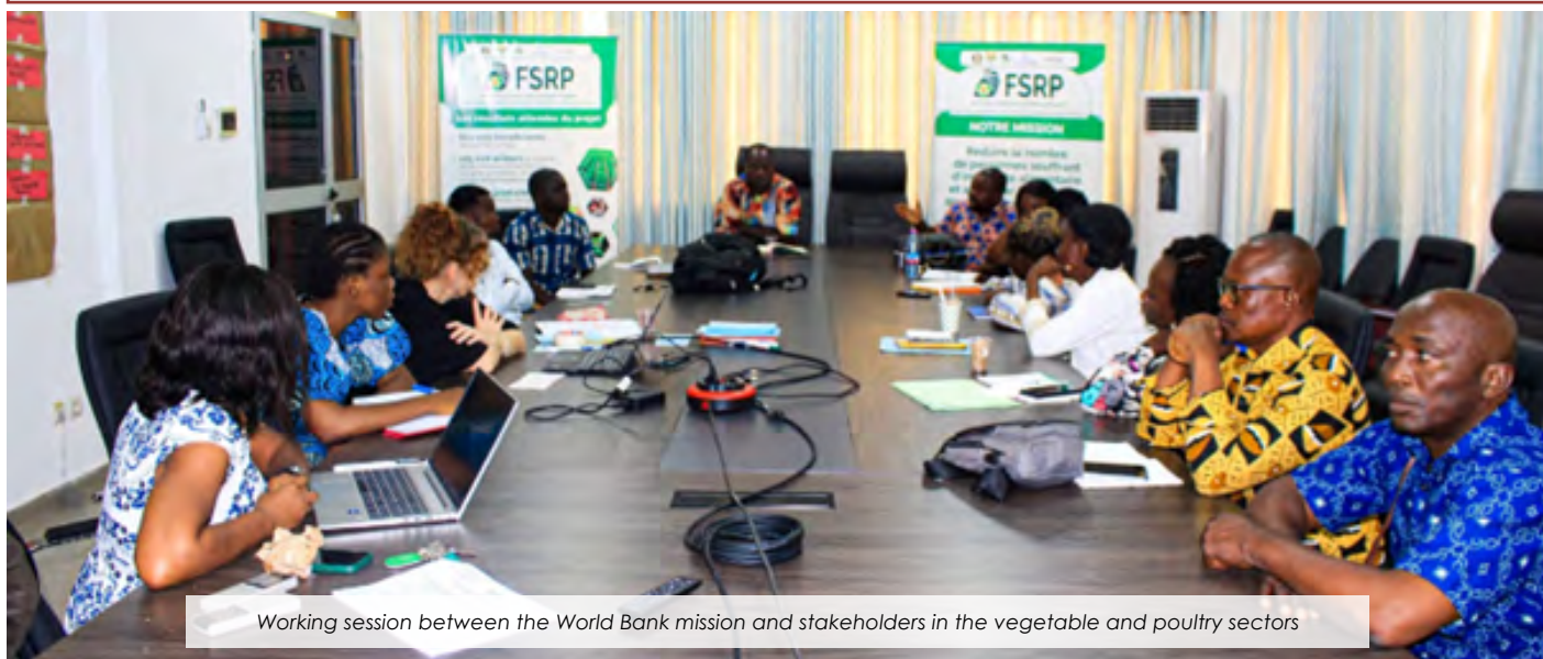
Working session between the World Bank mission and stakeholders in the vegetable and poultry sectors

As part of the implementation of FSRP, Togo is receiving support from the World Bank to assess the cold chain infrastructure in the vegetable and poultry sectors. To this end, exchange meetings were held from 14 to 22 March 2024 with stakeholders in the two selected sectors to assess the cold chain infrastructure and identify potential business cases for cold rooms in Togo... Read more