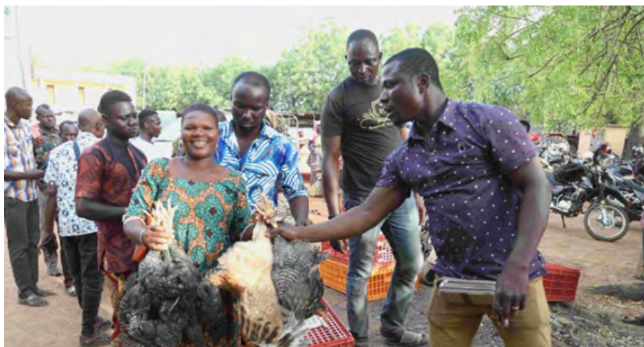
Farmers happy to receive poultry broodstock to boost productivity and increase poultry numbers

Raising poultry (hens and guinea fowl) is a common practice in the savannah region, formerly known as the "white gold" region. This is also the area par excellence for roasting and ploughing, where communities live partly from the production and marketing of poultry to meet the basic needs of their families... Read more