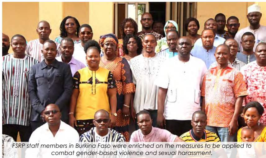
FSRP staff members in Burkina Faso were enriched on the measures to be applied to combat gender-based violence and sexual harassment.

On 20 March 2024 in Ouagadougou, stakeholders and implementing partners of the West Africa Food System Resilience Program (FSRP) in Burkina Faso were briefed on measures to combat sexual harassment and gender-based violence... Read more