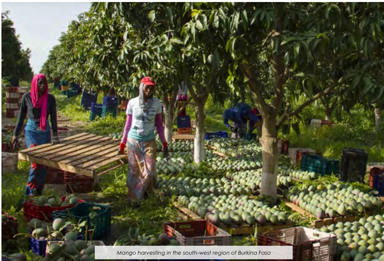
Mango harvesting in the south-west region of Burkina Faso