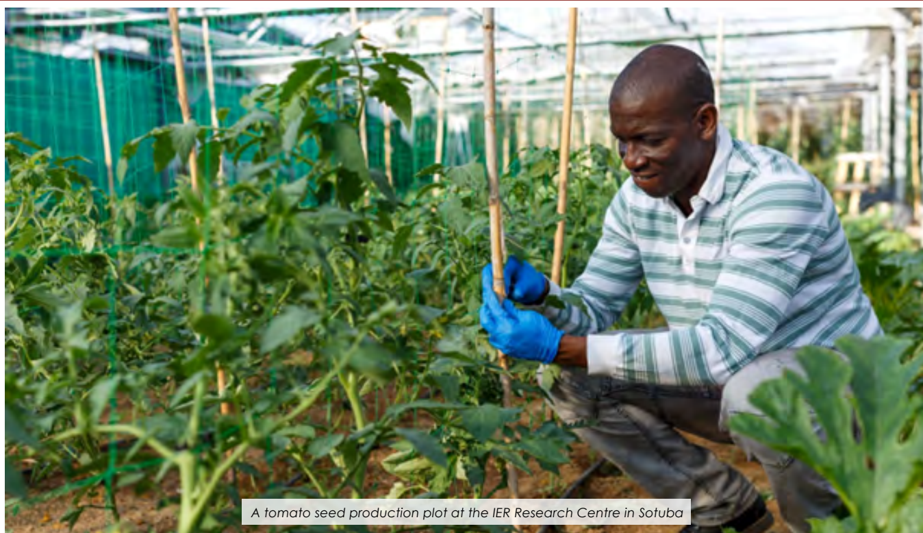
A tomato seed production plot at the IER Research Centre in Sotuba

Stakeholders in agricultural development in Mali were invited to the third open day of the Mali Technology Park. This activity, part of the implementation of component 2 of the West Africa food system resilience program, provided an opportunity to exchange views with users of agricultural technologies, with a view to ensuring their adoption and thus improving agricultural production... Read more