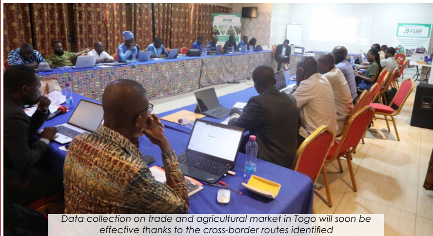
Data collection on trade and agricultural market in Togo will soon be effective thanks to the cross-border routes identified