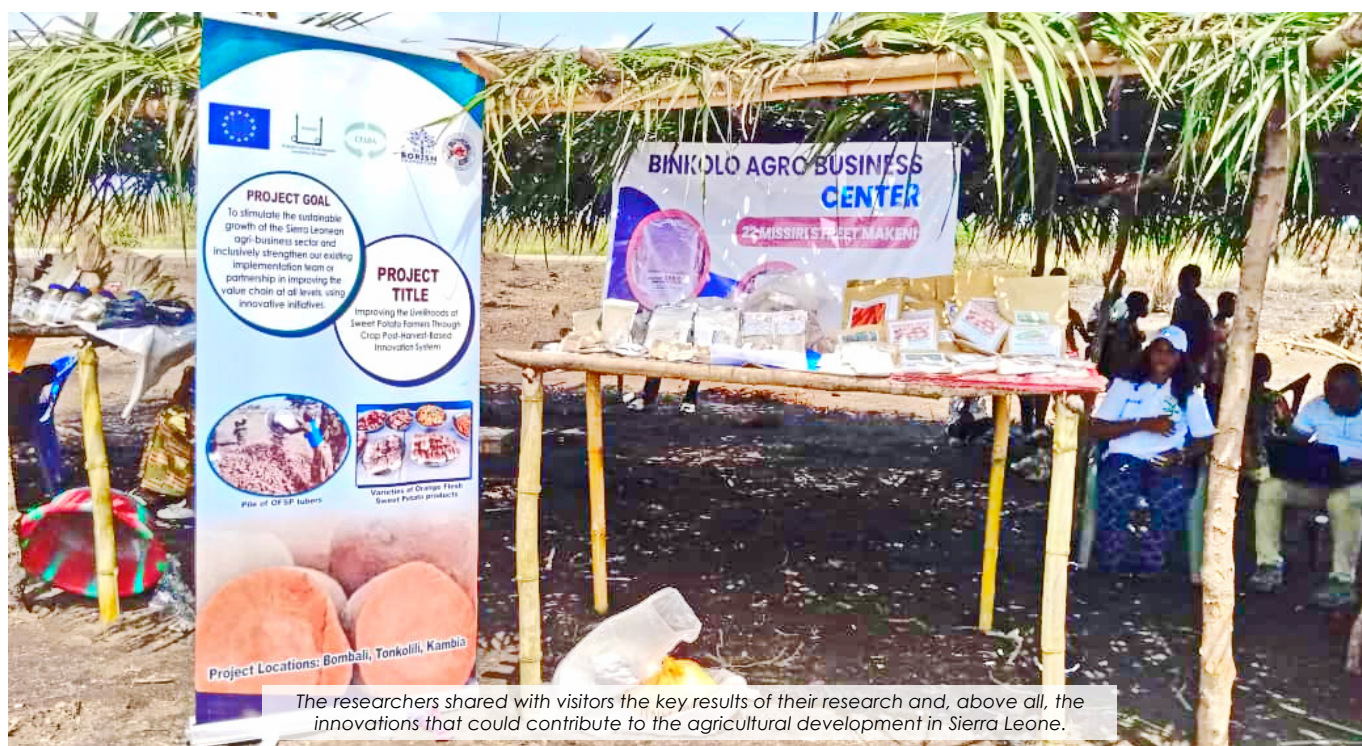
The researchers shared with visitors the key results of their research and, above all, the innovations that could contribute to the agricultural development in Sierra Leone.

On Thursday 9 May 2024, in the village of Komrabai, in the chiefdom of Maforki, in the district of Port Loko, took place the official launch of the technology and innovation park of the Sierra Leone Agricultural Research Institute (SLARI) with the support of CORAF took place as part of the implementation... Read more