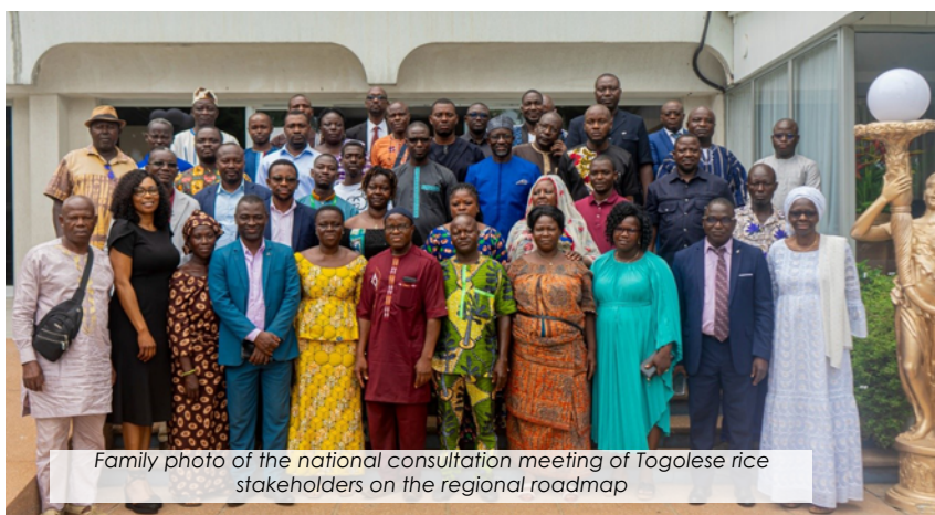
Family photo of the national consultation meeting of Togolese rice stakeholders on the regional roadmap

350 stakeholders and partners from 9 countries including Nigeria, Ghana, Côte d'Ivoire, Burkina Faso, Mali, Liberia, Sierra Leone and Togo took part in national consultations for the development of the ECOWAS rice roadmap from 25 April to 14 May 2024... Read more