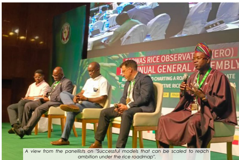
A view from the panellists on "Successful models that can be scaled to reach ambition under the rice roadmap".

1st General Assembly of the ECOWAS Rice Observatory: stakeholders in the rice sector adopt a roadmap for the development of the sector