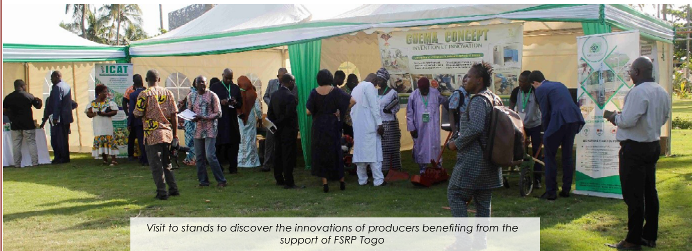
Visit to stands to discover the innovations of producers benefiting from the support of FSRP Togo

The West Africa Food System Resilience Programme (FSRP) held its 2024 first wrap up meeting of the support missions. The event took place from 15 to 17 May in Lomé, Togo. More than 70 participants from Burkina Faso, Ghana, Mali, Niger, Sierra Leone, Senegal and Togo, as well as regional institutions (CILSS, CORAF and ECOWAS) and the World Bank... Read more