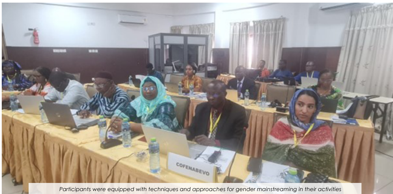
Participants were equipped with techniques and approaches for gender mainstreaming in their activities

The Regional Coordination of the West Africa Food System Resilience Programme (FSRP) organized from 7 to 9 May 2024 in Accra a gender training workshop for interprofessional bodies involved in regional agri-food value chains and intra-regional trade... Read more