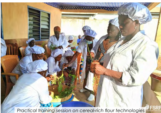
Practical training session on cereal-rich flour technologies

To help households improve their resilience in the face of food insecurity and malnutrition, the Food System Resilience Programme in West Africa (FSRP-TOGO) is supporting the training of 720 women processors in the production and use of cereal-rich flour for children incorporating moringa, néré and/or orange-fleshed sweet potato (PDCO), and in good hygiene and quality practices... Read more