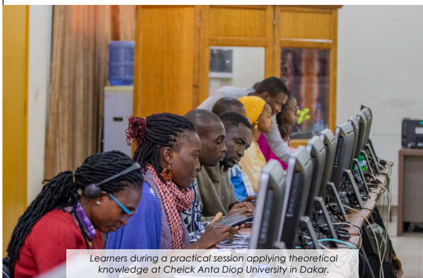
Learners during a practical session applying theoretical knowledge at Cheick Anta Diop University in Dakar.

As part of the West Africa Food System Resilience Program (FSRP), CORAF recently concluded a series of regional training workshops aimed at strengthening the skills of stakeholders in national agricultural research systems (NARS) in biotechnology and bioinformatics. These workshops, the latest of which took place at the end of 2023... Read more