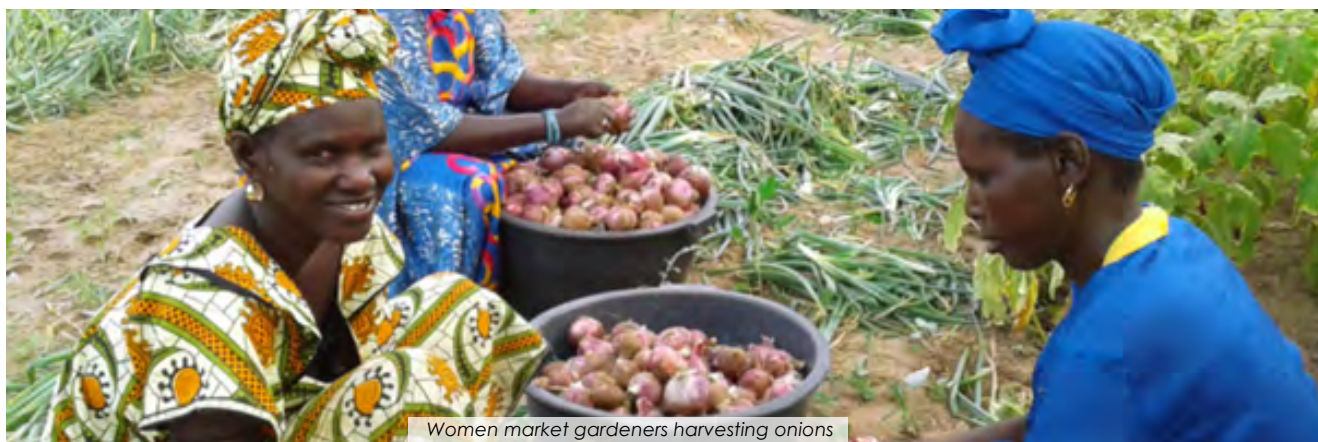
Women market gardeners harvesting onions

As part of the implementation of the multi-phase programmatic approach of the West Africa Food System Resilience Program (FSRP), the World Bank approved on 18 January 2024 a financing of 200 million dollars in support of the third phase of the program (FSRP-3) for Senegal... Read more