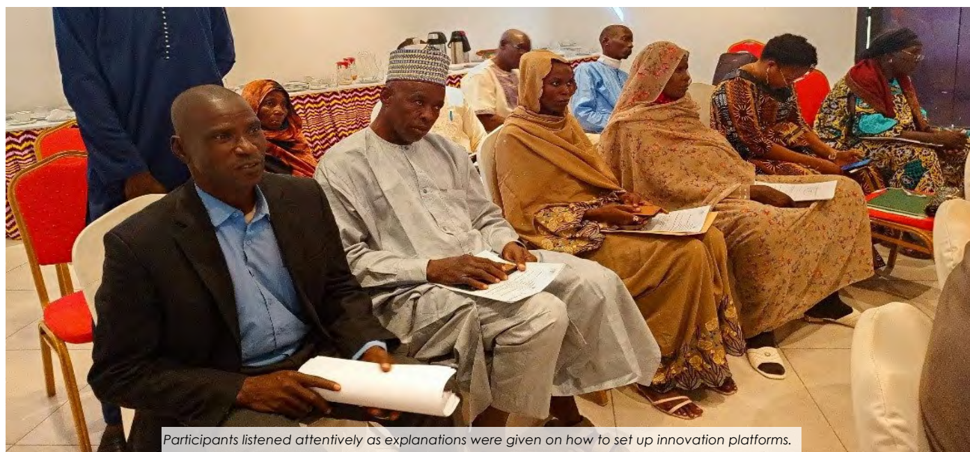
Participants listened attentively as explanations were given on how to set up innovation platforms.

With a view to accelerating the implementation of the West Africa Food System Resilience Programme (FSRP) in Chad, stakeholders and partners are being trained in innovative approaches and mechanisms for the production and dissemination of agricultural technologies... Read more