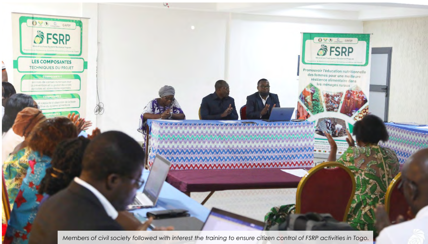
Members of civil society followed with interest the training to ensure citizen control of FSRP activities in Togo.

To reinforce the need for accountability in the implementation of its funding, civil society monitoring of activities has been integrated into the monitoring and evaluation mechanism of the Food System Resilience Programme in West Africa (FSRP-Togo). To this end... Read more