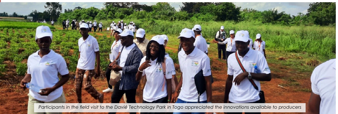
Participants in the field visit to the Davié Technology Park in Togo appreciated the innovations available to producers

The fourth Agricultural Technologies and innovations Market (MITA), organized by CORAF in partnership with the Togolese Institute for Agricultural Research (ITRA), took place from 21 to 25 October 2024 in Lome, Togo. Under the theme: "Facilitating access to agricultural technologies and innovations for the integrated management of pests..." Read more