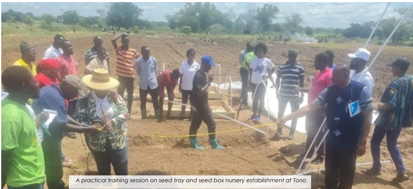
A practical training session on seed tray and seed box nursery establishment at Tono

In a move to address the yearly incidence of widely fluctuating prices of tomatoes across the country and to ensure year-round availability of tomatoes in Ghana, the Ministry of Food & Agriculture, through the West Africa Food System Resilience Programme (FSRP) has deployed a combination of interventions ... Read more