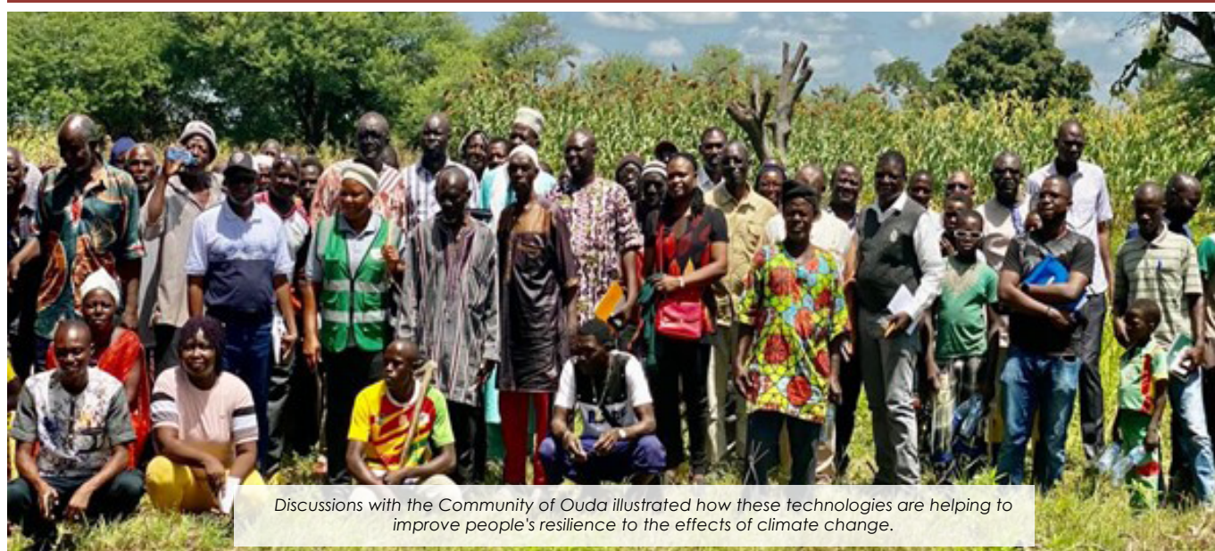
Discussions with the Community of Ouda illustrated how these technologies are helping to improve people's resilience to the effects of climate change.

Following the capacity-building workshop organised in Bamako by CORAF and the Bioversity International and CIAT Alliance, as part of the Accelerating the Impacts of CGIAR Climate Research for Africa (AICCRA) project, the stakeholders of the Food System ... Read more