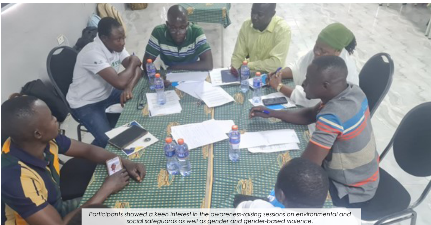
Participants showed a keen interest in the awareness-raising sessions on environmental and social safeguards as well as gender and gender-based violence.

The West Africa Food System Resilience Programme (FSRP) has mobilised 120 Agricultural Extension Agents (AEAs), 56 Schedule Officers and 56 District Directors of Agriculture to propagate and drive Environmental and Social Risk Management (ESRM) practices... Read more