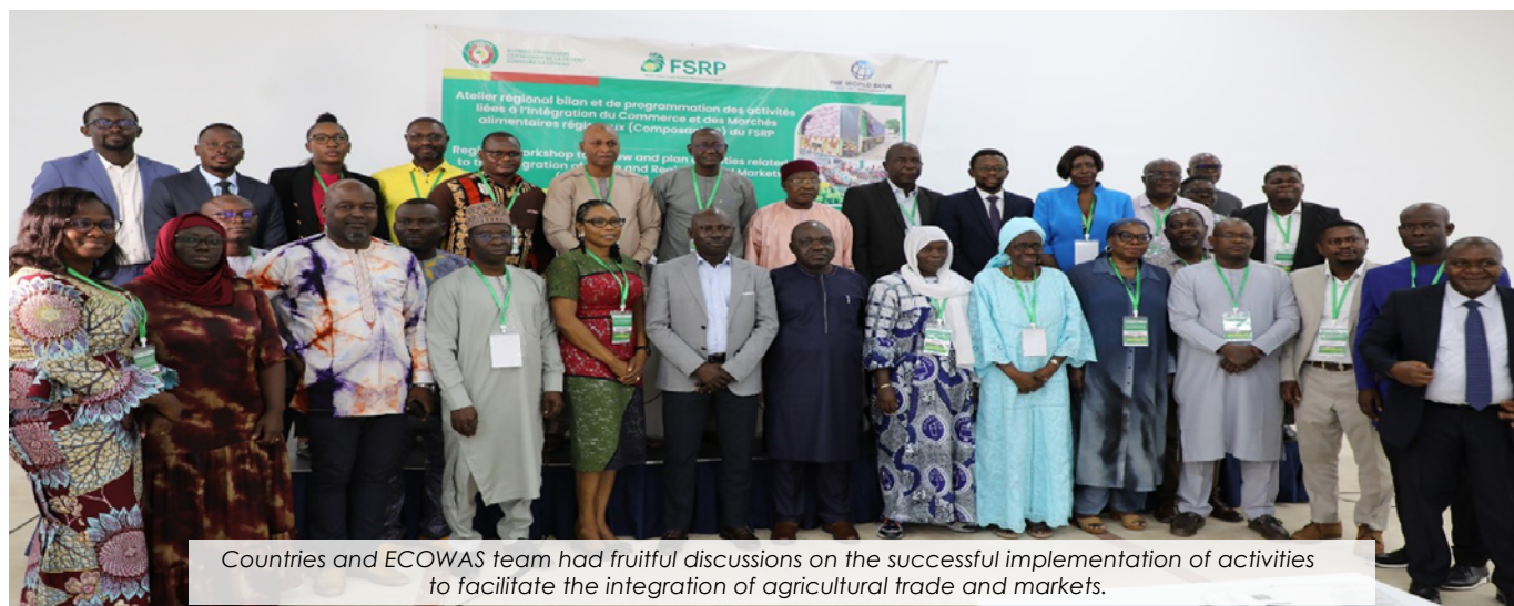
Countries and ECOWAS team had fruitful discussions on the successful implementation of activities to facilitate the integration of agricultural trade and markets.

From 29 to 31 October, the Togolese Capital Lome hosted a crucial meeting for the stakeholders and implementing partners of the West African Food System Resilience Programme (FSRP). The workshop provided an opportunity to take stock of activities under component 3 of the programme, devoted to the integration... Read more