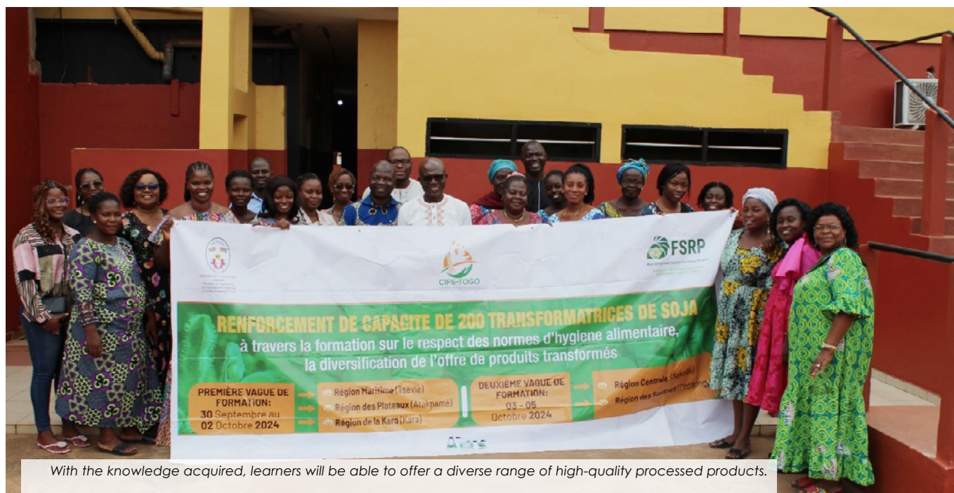
With the knowledge acquired, learners will be able to offer a diverse range of high-quality processed products.

In Togo, agri-food processing is a sector that creates wealth and provides jobs for the population. Soya processing is dominated by small-scale and semi-industrial units, with large-scale units now gradually being set up across the country... Read more