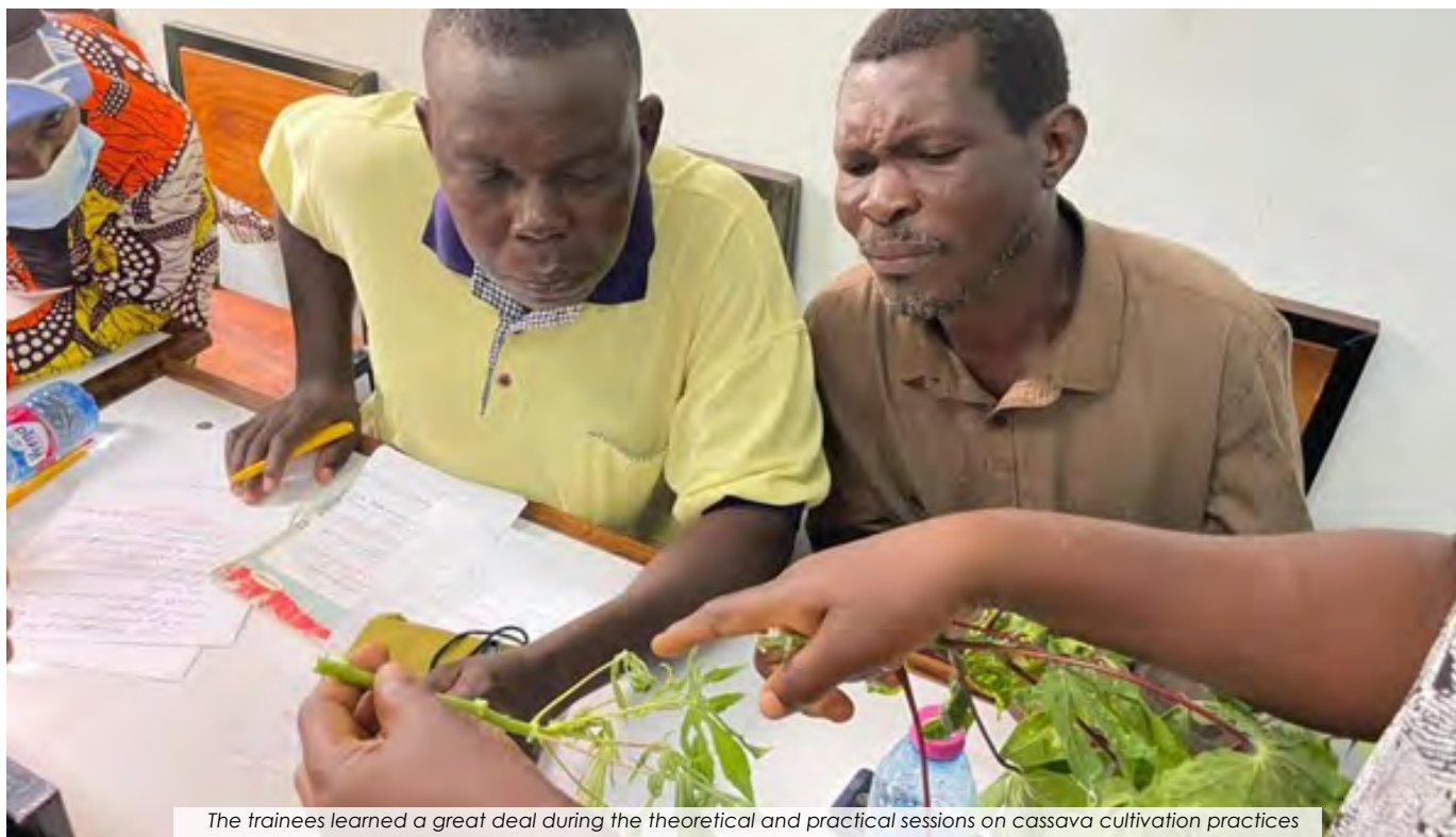
The trainees learned a great deal during the theoretical and practical sessions on cassava cultivation practices