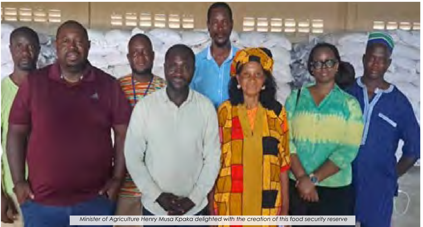
Minister of Agriculture Henry Musa Kpaka delighted with the creation of this food security reserve

The West Africa Food System Resilience Programme in Niger (FSRP Niger) has provided 324 women in its area of intervention with goat kits consisting of three animals per woman: one male breeding goat and two female breeding goats... Read more