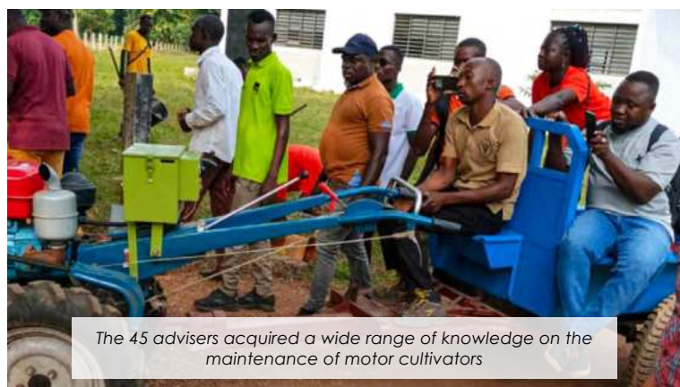
The 45 advisers acquired a wide range of knowledge on the maintenance of motor cultivators