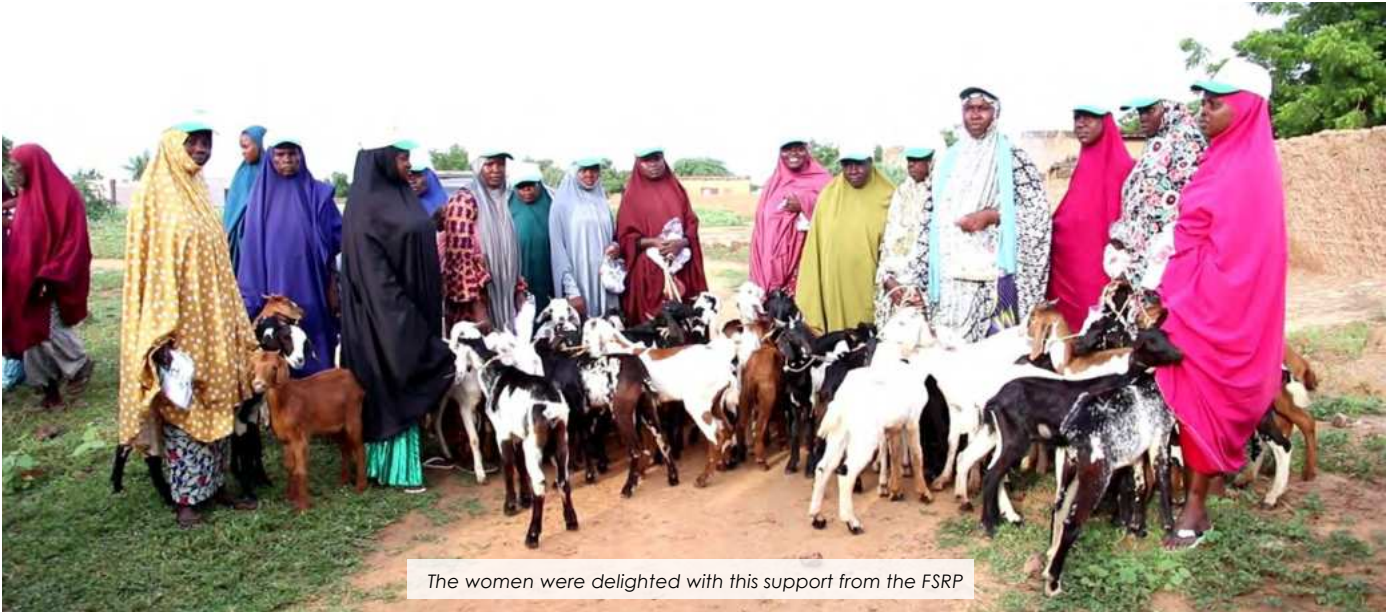
The women were delighted with this support from the FSRP

The West Africa Food System Resilience Programme in Niger (FSRP Niger) has provided 324 women in its area of intervention with goat kits consisting of three animals per woman: one male breeding goat and two female breeding goats... Read more