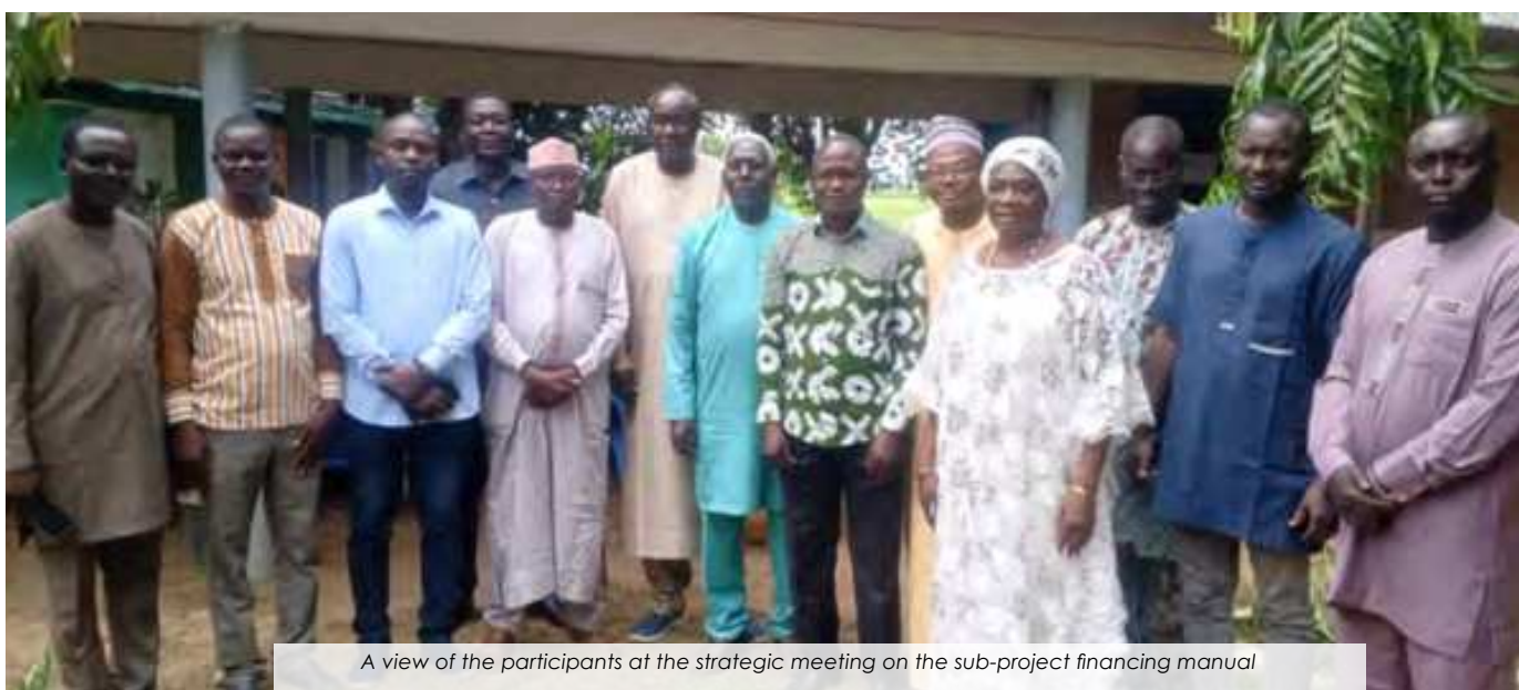
A view of the participants at the strategic meeting on the sub-project financing manual

From 10 to 16 September, the town of Bakara, some 20 kilometres from N'Djamena, hosted a strategic workshop dedicated to finalising the sub-project financing manual for the Project to Strengthen the Resilience of Agri-Food Systems in Chad (FSRP-TD).... Read more