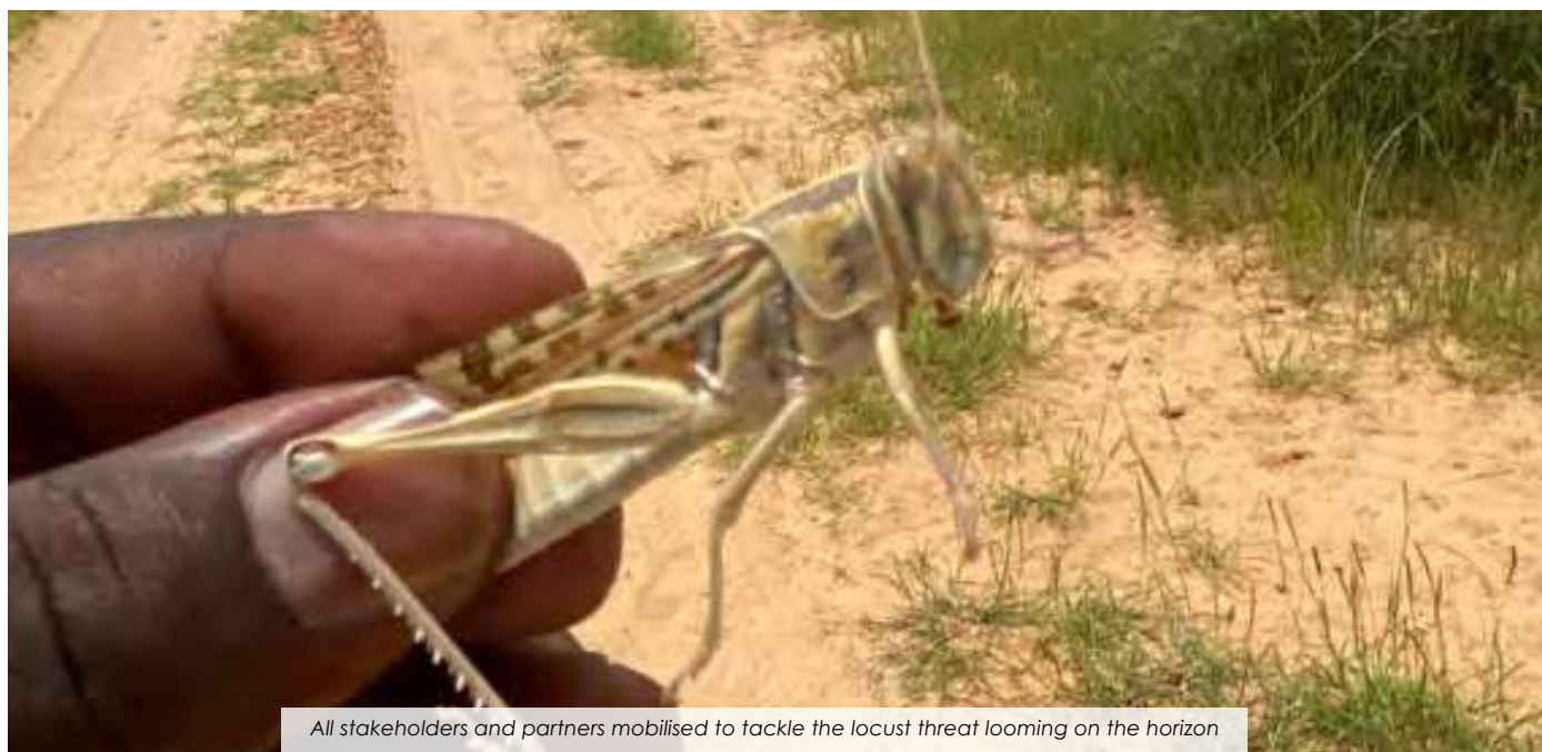
All stakeholders and partners mobilised to tackle the locust threat looming on the horizon

Faced with a growing threat from locusts, Chad is stepping up its vigilance. Since the beginning of September, the National Locust Control Agency (ANLA) has launched a vast prospecting campaign covering an area of more than 320,000 km 2 .... Read more